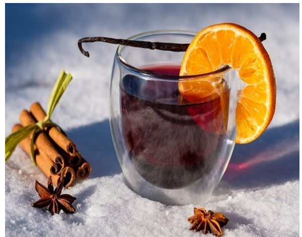
Mulled wine and mulled cider is being served at the pub to keep out those winter chills.

Visit this site for the latest news from the pub, café, post office and guest room. Sign up on the site for all future newsletters